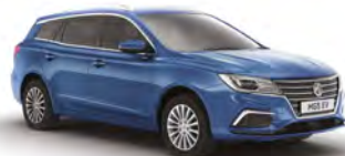
PICCADILLY BLUE METALLIC PAINT