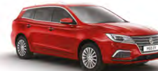
DYNAMIC RED TRI-COAT PAINT