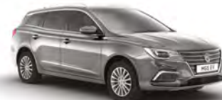
WESTMINSTER SILVER METALLIC PAINT