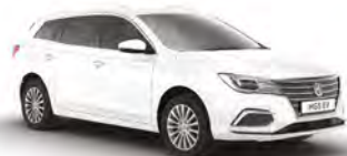
ARCTIC WHITE STANDARD PAINT

Make it your own. Choose from a range of dynamic, popular colours and finishes to suit every taste.