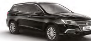
BLACK PEARL METALLIC PAINT